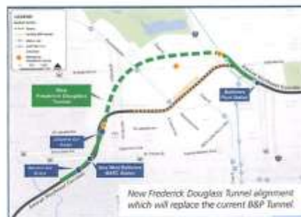
The New Tunnel Alignment